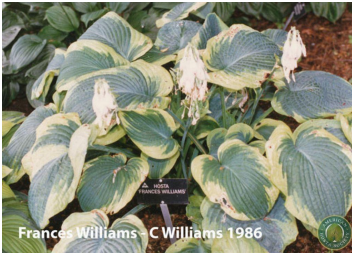
Registered Clump Photo