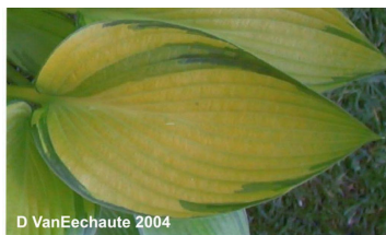
H. 'June Fever' leafdetail Registered Leaf Photo