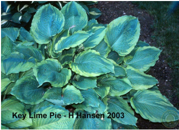
Registered Clump Photo