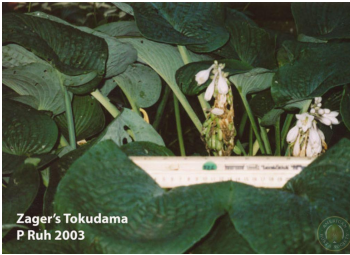
Registered Clump Photo