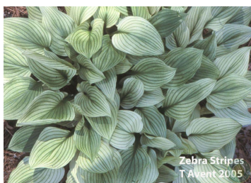
Registered Clump Photo