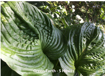
Registered Leaf Photo