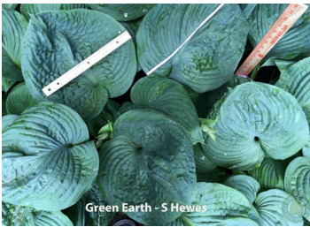
Registered Clump Photo