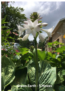
Registered Flower Photo