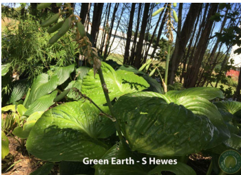
Registered Clump Photo