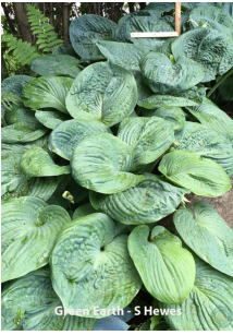
Registered Clump Photo