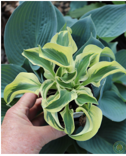
Photographer: R. Solberg; Clump Photo